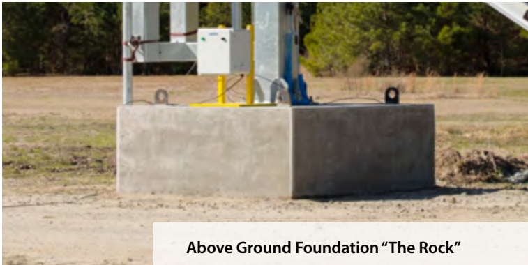
Above Ground Foundation "The Rock"